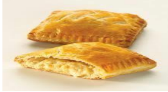
Cheese & Onion Pasty 1