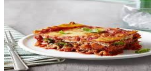
Vegetarian Lasagne 27 (Gluten Free Option Available on Request)