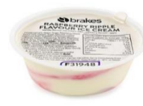
Yoghurt 18 Fruit Jelly or Ice Cream 19