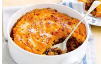
Vegetarian Cottage Pie with Sweet Potato Mash 11