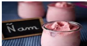
Raspberry Mousse Pots 7