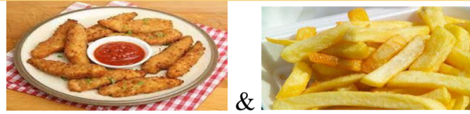
Sweet and Sour Chicken Nuggets 26 With Chips