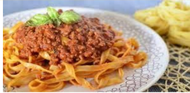
Tagliatelle Bolognese 10