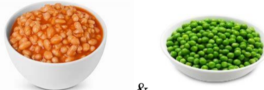
Baked Beans & Garden Peas