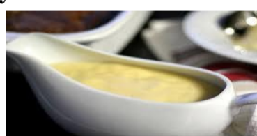
Pain Au Chocolat Pudding 16 with Custard 17