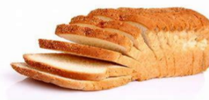
Salad Tray & Bread 15