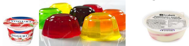
Yoghurt 32 Fruit Jelly or Ice Cream 33