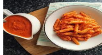
Jacket Potato with Coronation Chicken 12 or Penne 13 With Tomato & Mascarpone Sauce 14