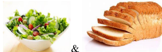
Salad Tray & Bread 29