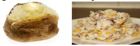
Jacket Potato with Chicken Bacon & Sweetcorn 28