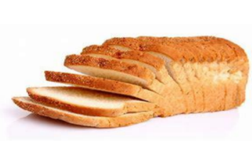
Salad Bar & Bread 6