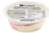
Yoghurt 8 Fruit Jelly or Ice Cream 9