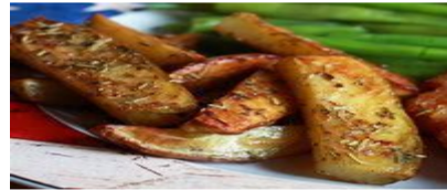
Herby Jacket Wedges