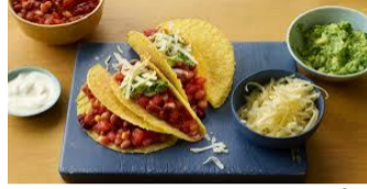
Vegetarian Tacos 2