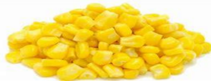
Baked Beans & Sweetcorn